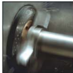
Die face cutting system