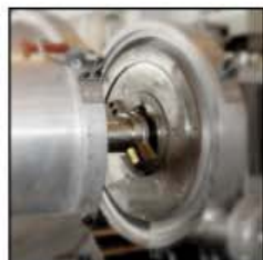
Water ring cutter